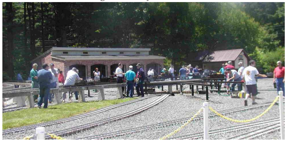
The Waushakum Live Steamers staging area, while locomotives are being warmed up for operation. The elevated 3 1/2" and 4 3/4" gauge track loops and the ground 7 1/4" gauge tracks are visible.