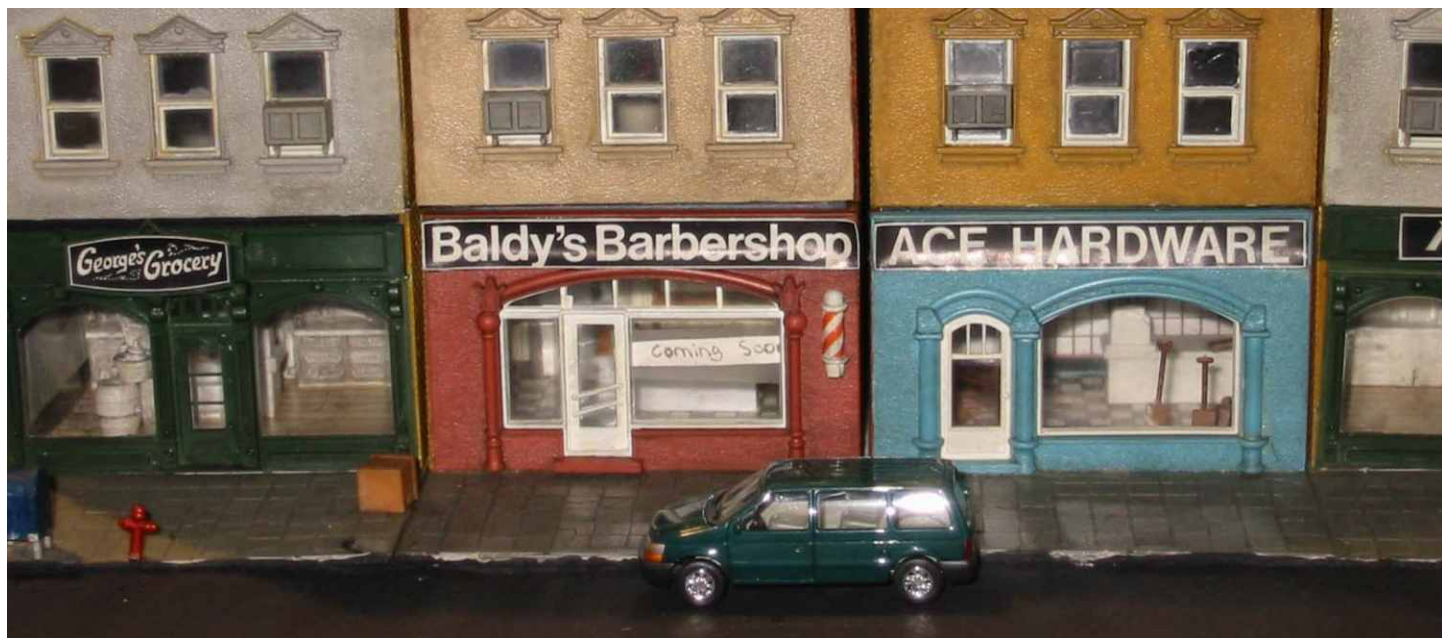
Viewers need to look closely to see the fine interior details on Greg Antonuccio's module, as seen at the HUB Division's Fall Show in Boxborough last November.

Headlight Printers Images and Ideas, Nashua, NH